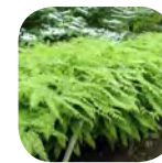
Adiantum pedatum - Maidenhair Fern Groundcover.