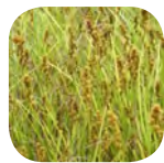
Carex lurida - Lurid Sedge. May-September.