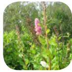
Spiraea tomentosa - Steeplebush July-September. Mound form.