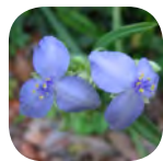
Tradescantia virginiana - Spiderwort August-September. Acidic.