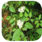
Cornus sericea - Red Osier Dogwood May-June. Erosion control. Spreads.