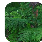
Osmunda regalis - Royal Fern Forms clusters. Full sun if kept moist.