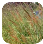
Sorghastrum nutans - Indiangrass September-February. Erosion control.