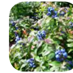
Vaccinium angustifolium - Lowbush Blueberry. May-June. Acidic soil.