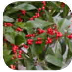
Ilex verticillata - Winterberry June-July. Erosion control.