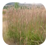
Andropogon gerardii - Big Bluestem September-February. Erosion control. Cut to ground in spring. Winter interest.