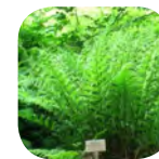
Athyrium filix-femina - Lady Fern Clumping and spreading.