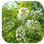
Aronia arbutifolia - Red Chokeberry April. Erosion control. Tolerates clay.

soil wet moist dry full sun part sun/shade full shade no pref. z: zone h: height s: spread