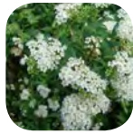
Spiraea alba - Meadowsweet Long blooms midsummer.