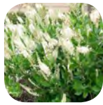
Clethra alnifolia - Summersweet July to August. Fragrant.