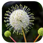
Cephalanthus occidentalis - Buttonbush June. Erosion control.