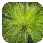
Carex vulpinoidea - Fox Sedge. July-August. Clumping. Erosion control.