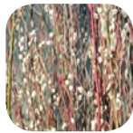
Salix discolor - Pussy Willow April-May. Erosion control.