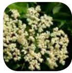
Sambucus canadensis - Elderberry June-July. Low maintenance.