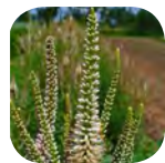
Veronicastrum virginicum - Culver's Root June-July. Rain gardens.