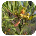
Myrica gale - Sweetgale. July-September. Fragrant. Shorelines.