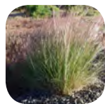
Aristida purpurea - Purple Threeawn May-September. Dry soils.