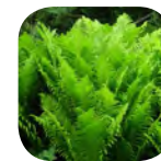
Matteuccia struthiopteris - Ostrich Fern Tolerates clay soils. Fiddleheads.