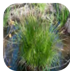
Carex stricta - Tussock Sedge May-June. Nesting habitat.