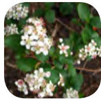
Aronia melonocarpa - Black Chokeberry May. Fruit is edible.